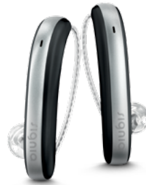
BLACK / SILVER