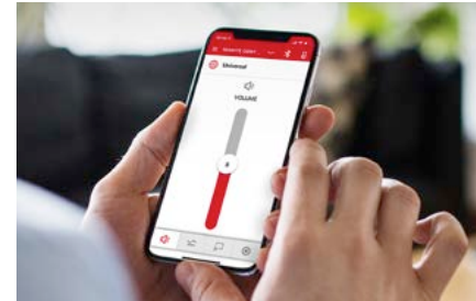
Remote control Discreetly control the volume and other settings