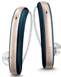
COSMIC BLUE / ROSE GOLD