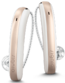
SNOW WHITE / ROSE GOLD

Styレット X is available in the following color combinations: