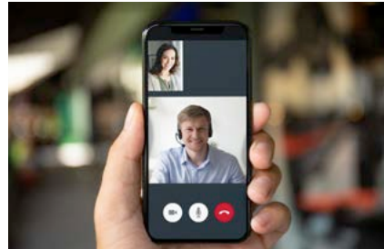
Signia TeleCare Remote support from your hearing care professional